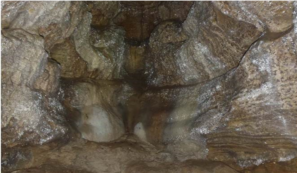
The Cloak Room