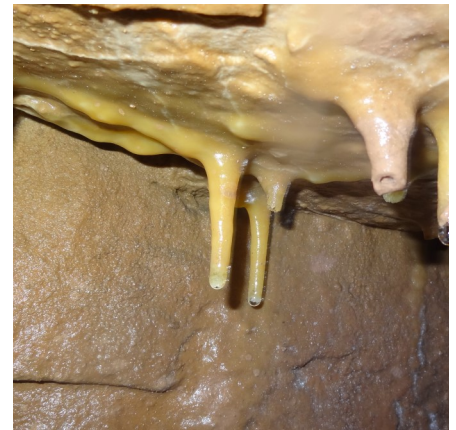
Soda Straw Stalactites

Cameras are, at the discretion of staff or trustee, permissible. Camera stands (tripods) are not allowed. Cameras must be decontaminated (Lysol wipes will be provided for this purpose) before entering the cave and immediately after exiting the cave.) Note that cameras may get wet/dirty/sandy.